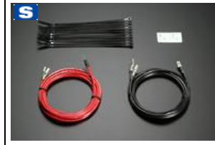
Craction Installation Kit ¥2,000 762121-0000

http://www.monster-shop.jp/index.php?main_page=product_info&products_id=589