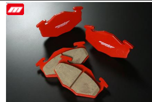
Rear Brake Pad ¥9,500 412120-4350M Type-E

http://www.monster-shop.jp/typee-p-1832.html