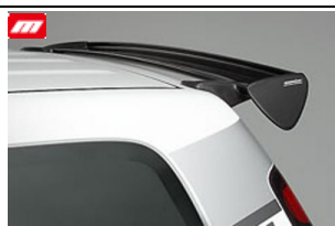
Carbon Rear Wing 8EQW10 (clear gel) ¥94,000 Make to order

http://www.monster-shop.jp/index.php?main_page=product_info&products_id=1687