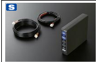
Master Unit DISCONTINUED 888500-0000

http://www.monster-shop.jp/index.php?main_page=product_info&products_id=7288