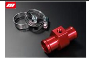
Water Temperature Sensor Adapter ¥3,800 882128-0000M For \Phi 27-28mm

http://www.monster-shop.jp/index.php?main_page=product_info&products_id=84