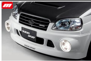
Fog Lamp Set ¥40,000 795500-4350_S9682 IPF Fog lamp set

http://www.monster-shop.jp/index.php?main_page=product_info&products_id=65