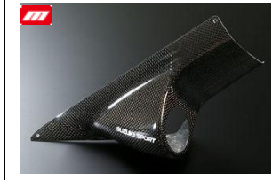
Carbon Pillar Meter Hood ¥16,000 851520-4350M Dia 52mm For RHD

http://www.monster-shop.jp/index.php?main_page=product_info&products_id=2380&language=en