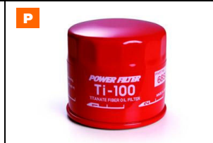
Oil Filter Ti-100 ¥2,500 68SU

http://www.monster-shop.jp/index.php?main_page=product_info&products_id=2316