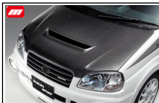
Carbon Front Hood 8EQB10 (clear gel) ¥96,000 Make to order

http://www.monster-shop.jp/index.php?main_page=product_info&products_id=1687