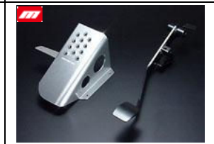
Clutch Pedal & Foot rest Set ¥19,000 845500-4350M For RHD

http://www.monster-shop.jp/index.php?main_page=product_info&products_id=2727