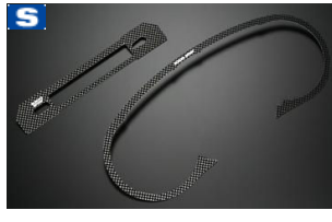
Carbon Meter Panel ¥7,800 852500-4350

http://www.monster-shop.jp/index.php?main_page=product_info&products_id=1805