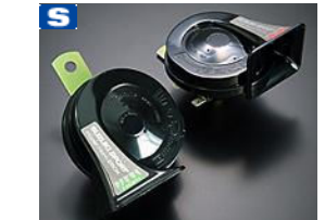
Craction Set Discontinued 762500-0000 High&Low, 250K

http://www.monster-shop.jp/index.php?main_page=product_info&products_id=1805