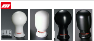
Shift Knob [Screw Type] M12 x 1.25 L=25 For MT only 831130-0000M [Ball, Black] ¥4,700 831135-0000M [Ball, white] ¥4,700 831140-0000M [Stick, Black] ¥4,700 831145-0000M [Stick, White] ¥4,700

http://www.monster-shop.jp/index.php?main_page=product_info&products_id=1009&language=en