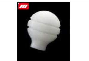
WR Shift Knob ¥4,000 831120-0000M M12 x 1.25 For MT only

http://www.monster-shop.jp/index.php?main_page=product_info&products_id=2818