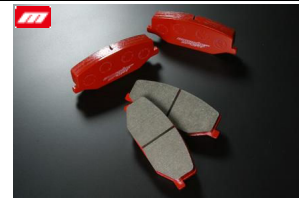
Front Brake Pad Set ¥23,000 4VL36-A21M Type-RX

http://www.monster-shop.jp/index.php?main_page=product_info&products_id=2818