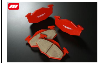
Front Brake Pad Set ¥9,500 411120-3000M Type-E

http://www.monster-shop.jp/index.php?main_page=product_info&products_id=1803