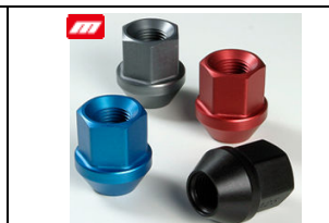
Aluminium Wheel Nut ¥500/1pc 89131-0000M[Blue], 689171-0000M[Red] 689181-0000M[Gray], 689191-0000M[Black]

http://www.monster-shop.jp/index.php?main_page=product_info&products_id=3184