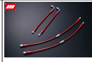
Stainless Mesh Brake Line ¥19,000 470561-4350M

http://www.monster-shop.jp/index.php?main_page=product_info&products_id=2403&language=en