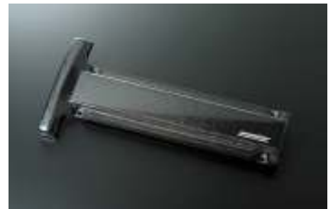
Carbon spark plug cover ¥14,000