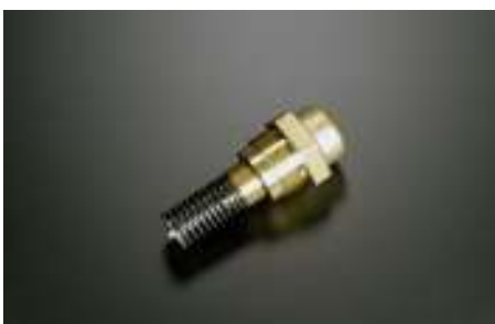
Reinforced oil thermo valve ¥7,500