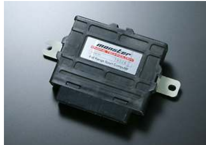
Full range ACD-ECU ¥50,000