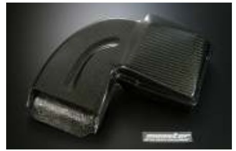
Intake duct ¥40,000