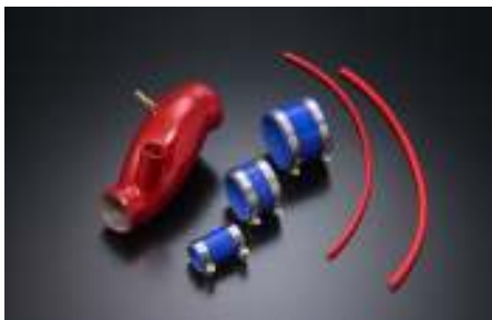
Suction pipe kit ¥29,000