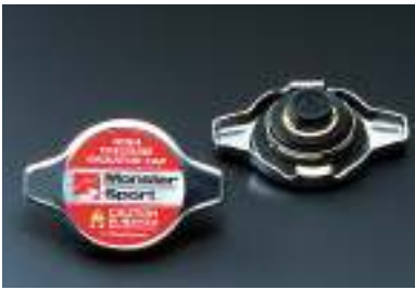
Radiator Cap ¥2,800