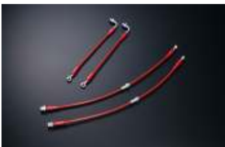
Brake line ¥30,000