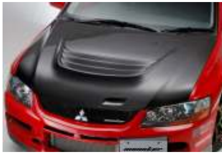
Carbon air outlet hood Standard¥118,000 Clear Paint¥158,000