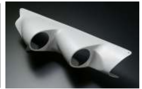
Pillar meter hood double Φ 60 x 2 ¥16,000