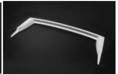
High mount spoiler -base ¥68,000