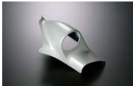
Pillar meter hood single Φ 60 ¥14,000