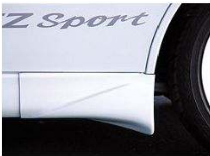
Rear air spats ¥18,000