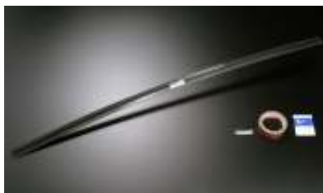
Carbon garnish flap ¥25,000