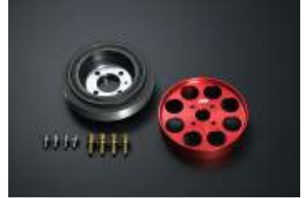
Low friction water pump pulley ¥38,000