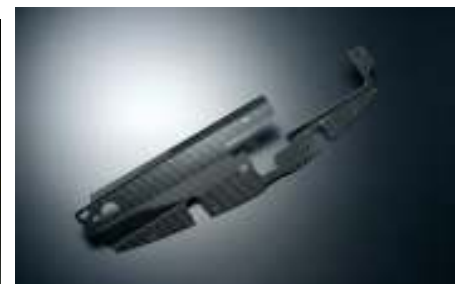
Carbon radiator shroud ¥12,000