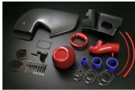
PFX intake kit ¥88,000