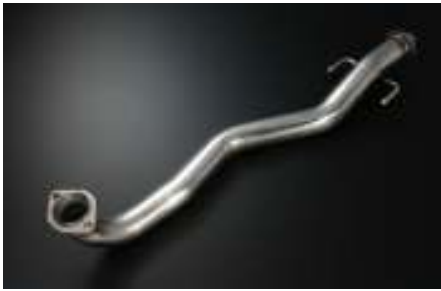
Front pipe ¥30,000