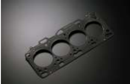
Metal head gasket [T0.8, 1.0, 1.2] ¥25,000