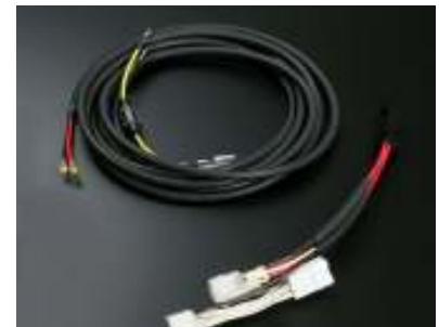
Fuel pump harness ¥13,500