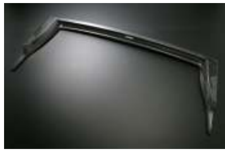
Carbon High mount spoiler -base ¥95,000