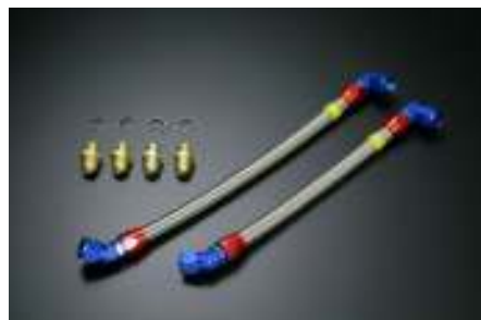
Low pressure oil line ¥45,000