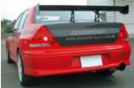
Carbon trunk ¥78,000