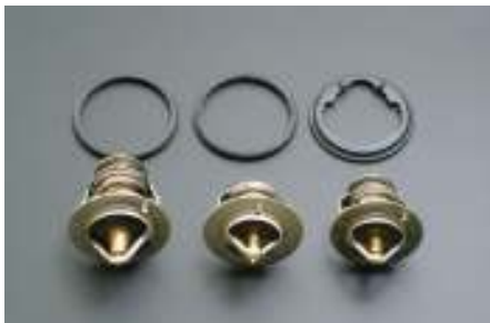
Low Temperature Thermostat ¥6,000