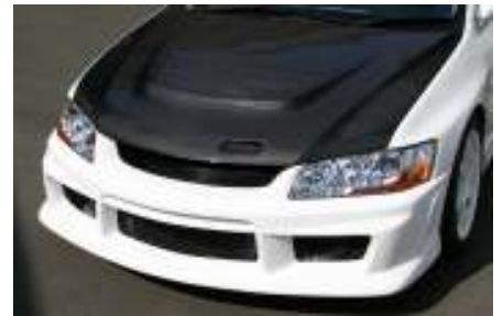
FRP front bumper ¥80,000