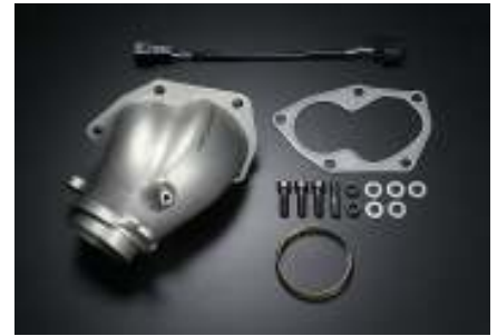
Turbo outlet DISCONTINUED