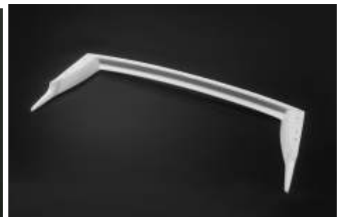
High mount spoiler -base ¥68,000