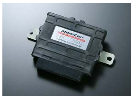
Full range ACD-ECU ¥50,000