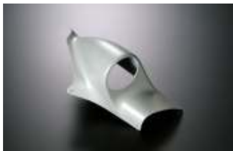
Pillar meter hood single \Phi 60 ¥14,000