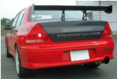
Carbon trunk ¥78,000