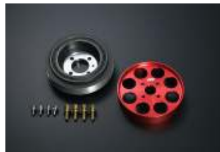
Low friction water pump pulley ¥38,000