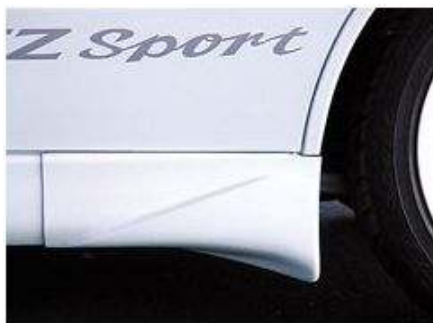
Rear air spats ¥18,000