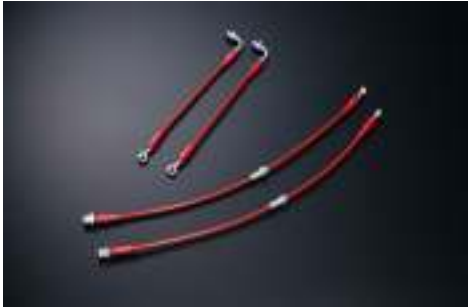
Brake line ¥30,000