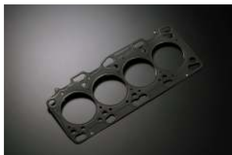
Metal head gasket [T0.8, 1.0, 1.2] ¥25,000