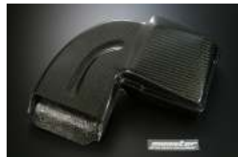
Intake duct ¥40,000