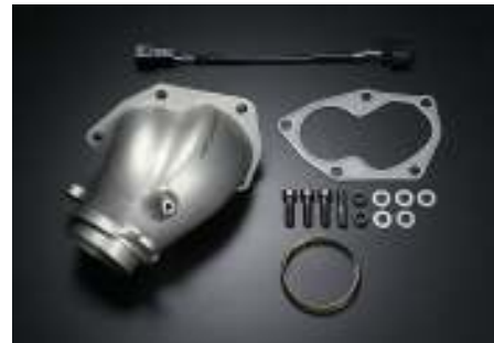
Turbo outlet DISCONTINUED