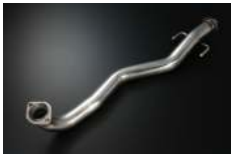
Front pipe ¥30,000