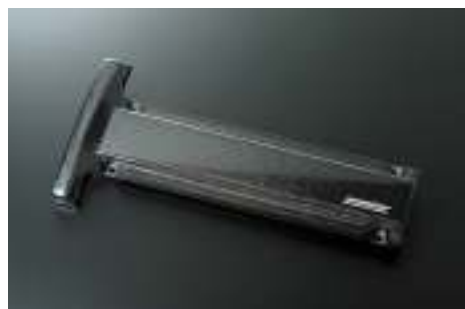
Carbon spark plug cover ¥14,000