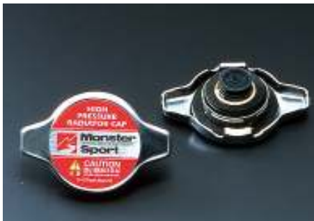
Radiator Cap ¥2,800