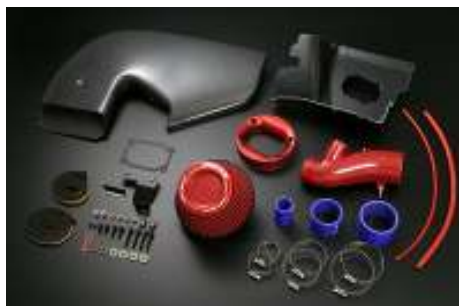
PFX intake kit ¥88,000