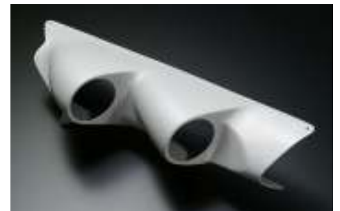
Pillar meter hood double \Phi 60 \times 2 ¥16,000