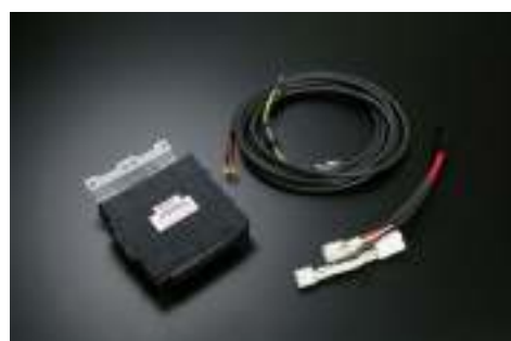
Full range computer [Trade-in] ¥95,000