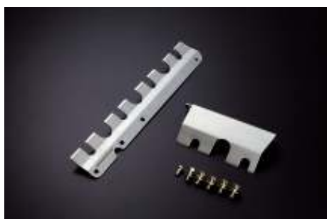
Low friction oil cutter ¥27,000